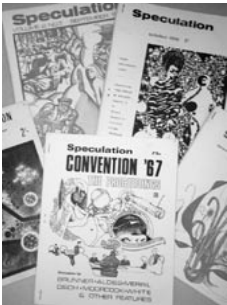
Sampling of the science fiction fanzines that make up the Horvat Collection.