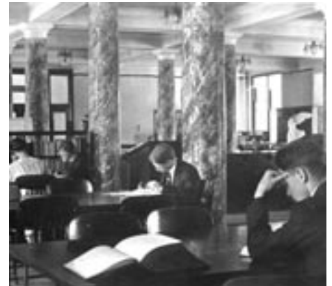
Students studying in the library at MacBride Hall in the early 1910s.

The start of a new century found the University of Iowa Libraries on the brink of a new era as the University's five-year, $1 billion dollar, comprehensive campaign, "Good. Better. Best. Iowa!" included a $12 million goal for the Libraries. This funding will allow the Libraries to continue its tradition of excellence for the next 150 years.