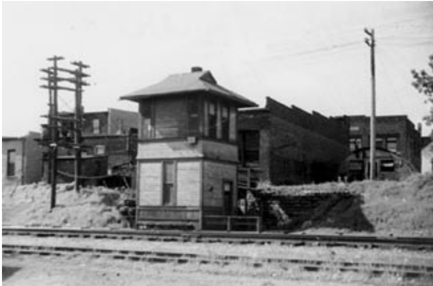
Part of the John P. Vander Maas Railroadiana Collection, this photo of a railway station in Belle Plaine, Iowa, was originally taken July 15, 1957. It was digitized in April 2005 and placed in the Iowa Digital Archives.