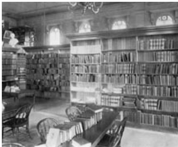
Taken just a year before the devastating fire, this photo is of the reading area in the North Hall Library.

In 1882, the growing library was moved to the second floor of North Hall despite repeated warning that the building