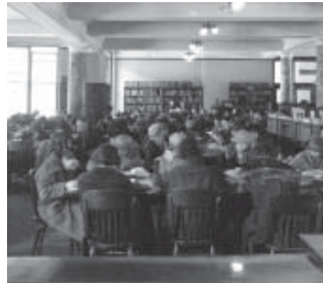
Library in the Hall of Natural Science, January 1926 (renamed Macbride Hall in 1934)

In 2005, the Libraries will celebrate 150 years as the intellectual center of the University. We will be commemorating this occasion with special exhibitions and campus and community events. Watch for more information in upcoming issues of Bindings .