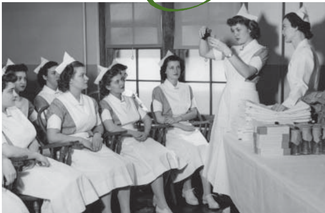
Sophomore nursing students learning to pair medications, March 1948, UI College of Nursing Records