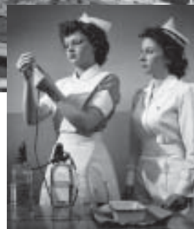
1948 UI College of Nursing records