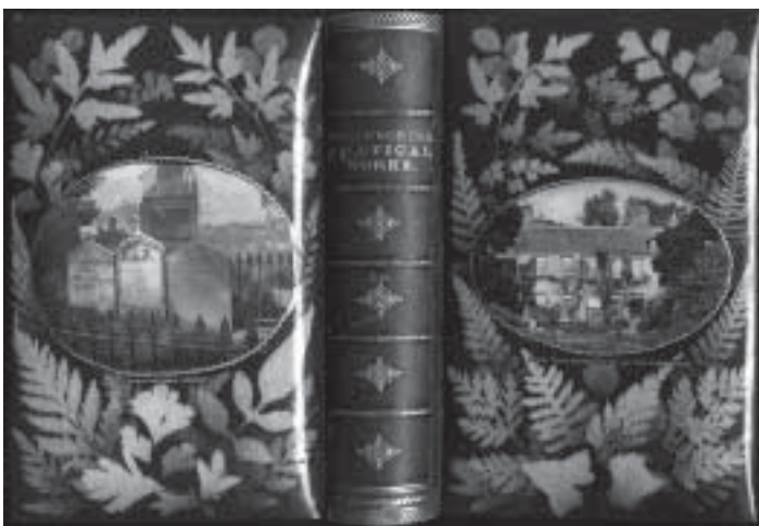
Wordsworth's Poems , an example of Mauchline Ware bookbinding

Another kind of thing we keep an eye out for is ephemeral material that enhances and enlarges the Libraries' strong collection of popular culture materials for the period 1890-1940, a period during which live performance gave ground to movies and radio (and was further much dimin-