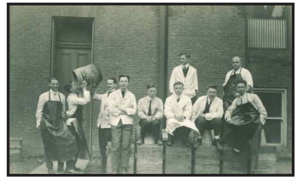
Images: Surgical Clinic Lecture 1897, Lecture Course Ticket on Surgery 1870, Graduating Medical Class of 1914, Old Hospital West Wing Added 1914, New University Hospital 1928, Full Lecture Hall 1920