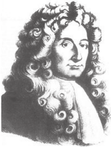
FRANÇOIS MAURICEAU (1637-1709)

Traité des maladies des femmes grosses, et de celles qui sont nouvellement accouchées. Chez l'auteur 1675 2nd ed.