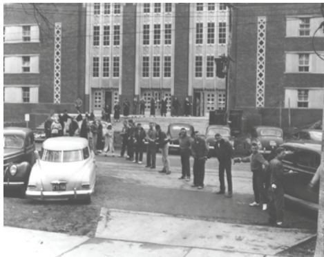
Main Library, 1951

As with other research libraries across the nation, the UI Libraries experienced an upsurge of growth during the 1960s and 1970s. During this period the book collections grew from 950,000 volumes to over 2,350,000 volumes. Unfortunately, by the end of the 1970s, funding became less plentiful. Inflation rendered