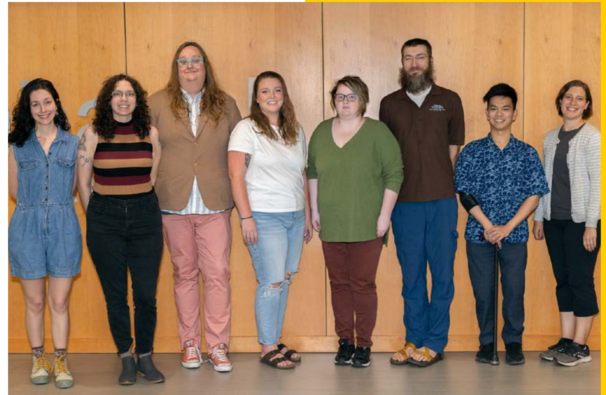
2023 Digital Scholarship & Publishing Studio Summer Fellowship Cohort.

Students are encouraged to develop their own projects and/or pursue the development of digital scholarly skills, and are given instruction on a host of software and other technology available to create their work.