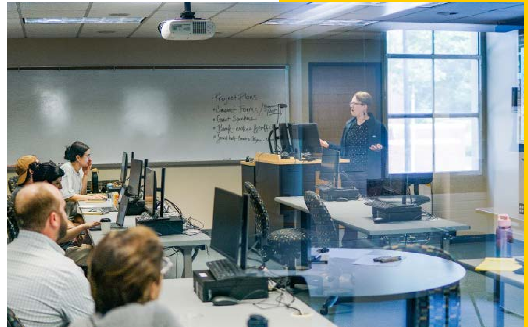
2025 Digital Scholarship & Publishing Studio Summer Fellowship Course.