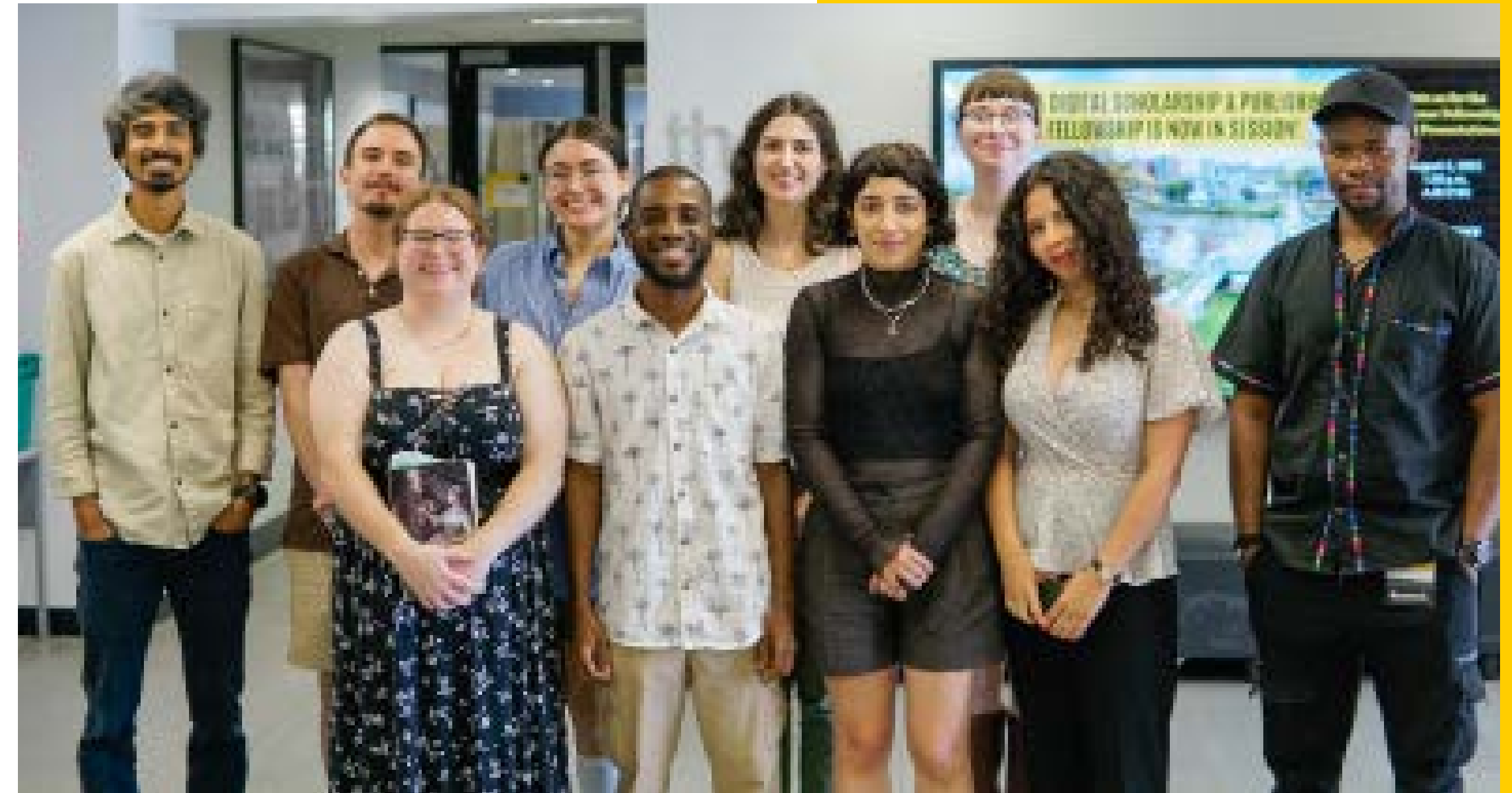
2025 Digital Scholarship & Publishing Studio Summer Fellowship Cohort.

Students are encouraged to develop their own projects and/or pursue the development of digital scholarly skills, and are given instruction on a host of software and other technology available to create their work.