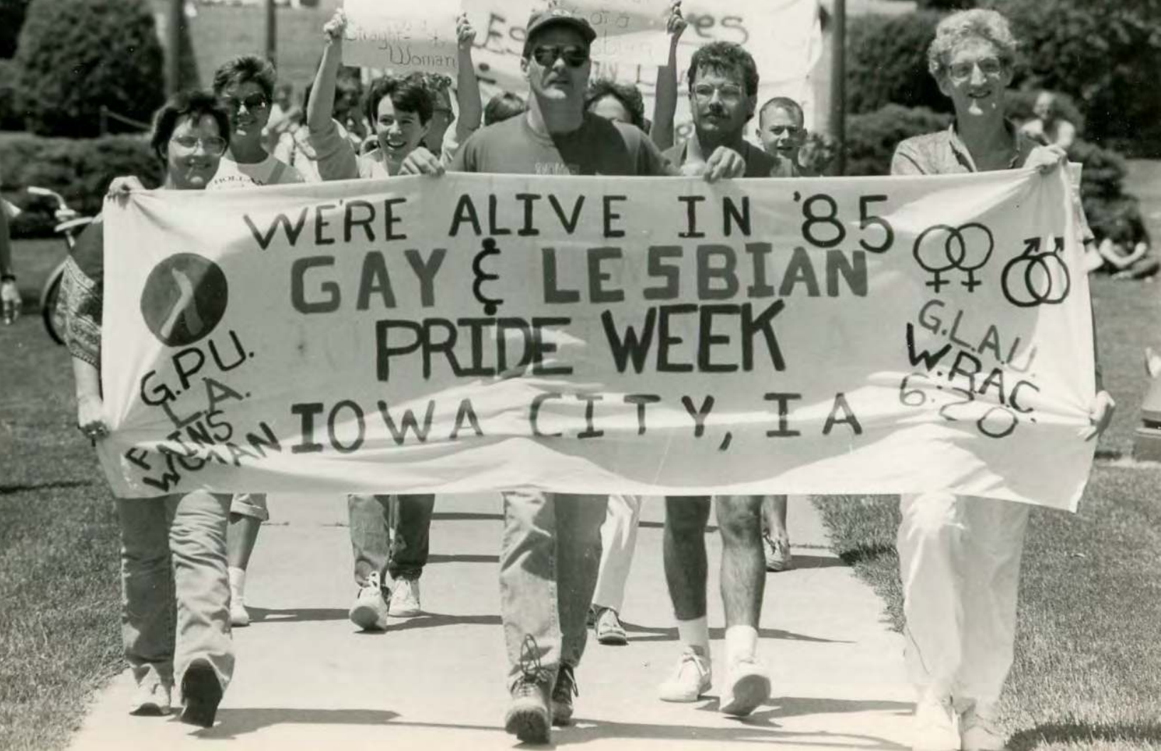
Scrapbook photos, 1980s. Gay, Lesbian, Bisexual, Transgender and Allies Union Records [RG02.0003.018], University Archives.