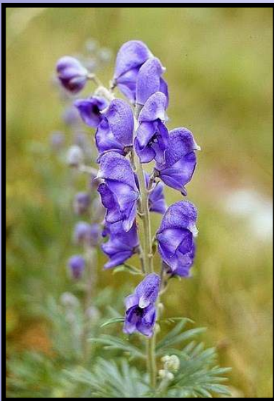
Wolfsbane. Henry IV, Part II

Thirty seven books from 1531 to 1697 will be on display highlighting general medical beliefs, herbals, monsters, poisons and cures, contemporaries of Shakespeare, and doctors in Shakespeare's plays.