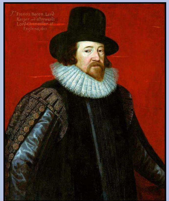
Sir Francis Bacon. Sylva Sylvarum, or A natural history , 1670