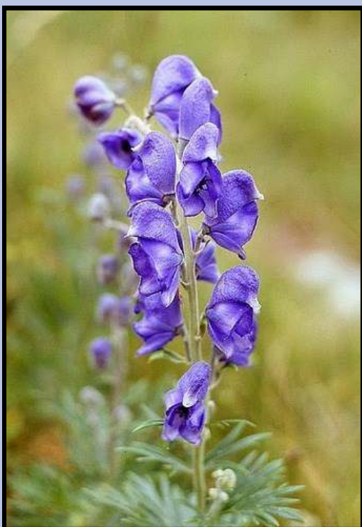
Wolfsbane. Henry IV, Part II

Thirty seven books from 1531 to 1697 will be on display highlighting general medical beliefs, herbals, monsters, poisons and cures, contemporaries of Shakespeare, and doctors in Shakespeare's plays.