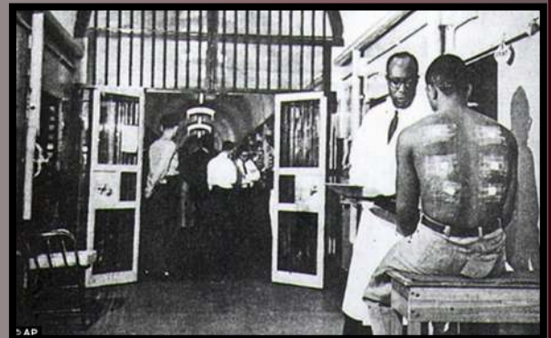
Holmesburg Prison, 1951-1974